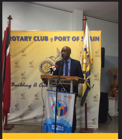
Minister Robert Le Hunte addressed the club on the budget