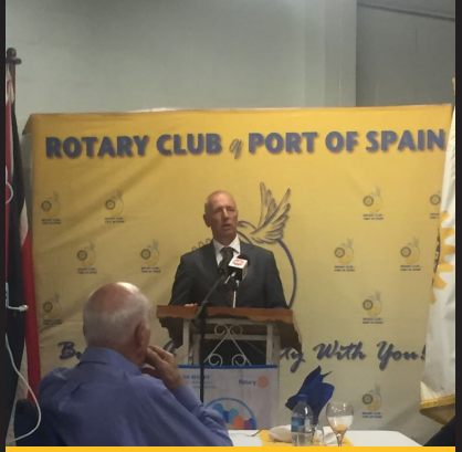
Ambassador of the Delegation of the European Union to Trinidad and Tobago - H.E. Arend (Aad) Biesebroek addresses the Club on Sustainable Development